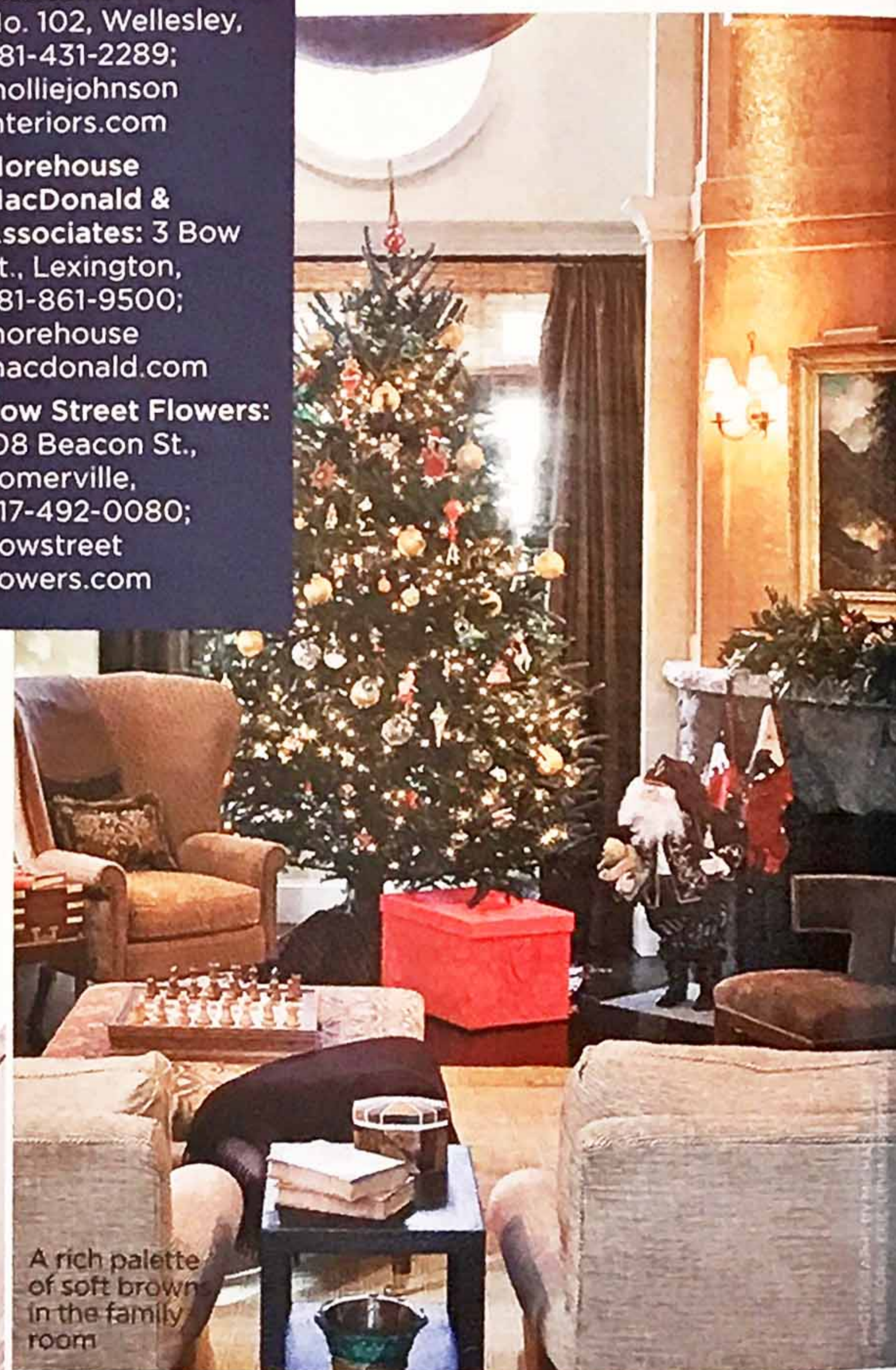
A rich palette of soft brown in the family room.