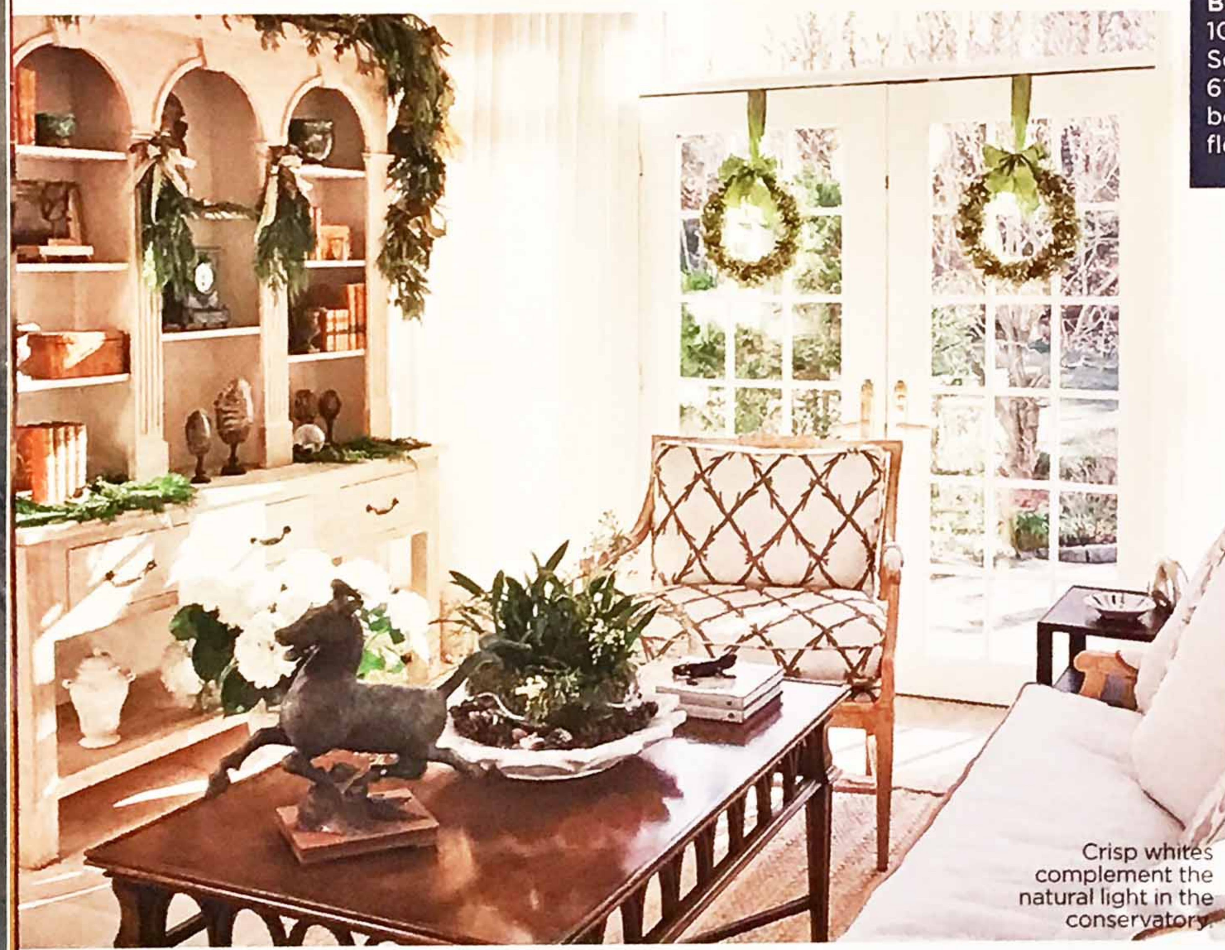
Crisp whites complement the natural light in the conservatory.

Bow Street Flowers: 108 Beacon St., Somerville, 617-492-0080; bowstreetflowers.com