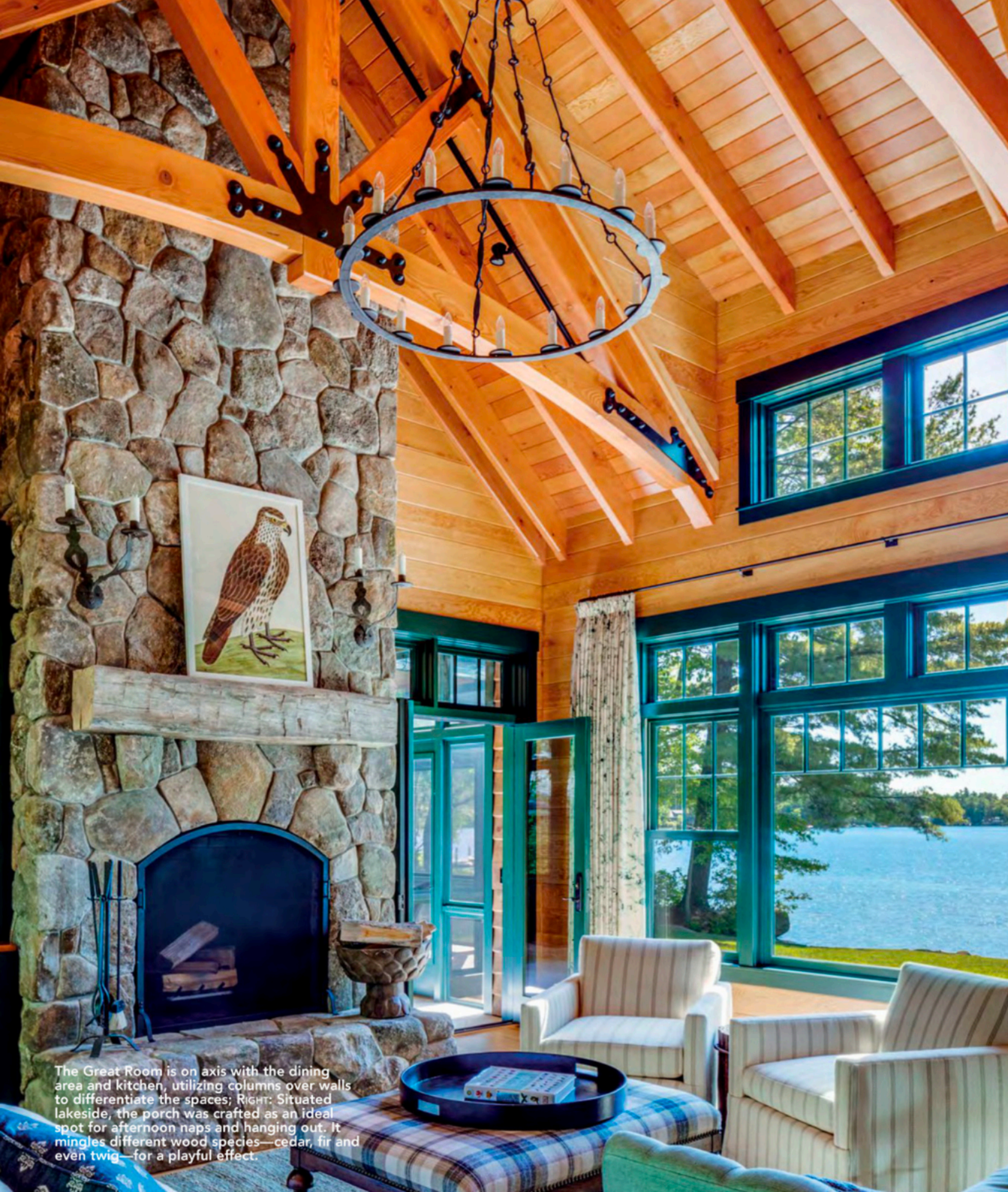
The Great Room is on axis with the dining area and kitchen, utilizing columns over walls to differentiate the spaces; RIGHT: Situated lakeside, the porch was crafted as an ideal spot for afternoon naps and hanging out. It mingles different wood species—cedar, fir and even twig—for a playful effect.

A new homeowner, who spent many lazy summer days at his parents' lake home as a child, is a believer. While his career carried this young man and his family west, come July he feels the pull of the East Coast and an instinct to gather lakeside with friends and family. This inclination, along with happy memories, compelled him to build a restful retreat and roots of his own.