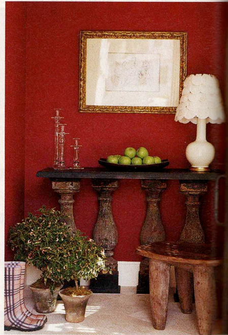
FIXED RESULTS: Once the heavy lifting was completed on the fix-up projects and custom building jobs around the apartment, Johnson focused on filling the home with character. At right, this page, greenery adds life to a room, while rain boots ground it in the reality of Boston's temperate climes. Below, the open kitchen invites conversation. Opposite, the living room, with its custom built-ins.